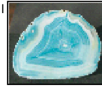
Agate geode (blue)

The Erle Crull Rock and Mineral Collection features 2,600 specimens from around the world, including spectacular gold samples from Goldcorp.