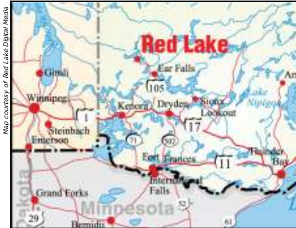
Red Lake is located 174 km or 110 miles north of the Trans Canada Highway.