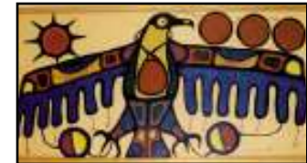
(thunderbird) ca. 1960 Acrylic on kraft paper 76.84x158.12 cm Red Lake Heritage Centre Collection

The history and culture of the region's Aboriginal community is showcased at the Heritage Centre. Here you will find artifacts from archeological digs, unique ceremonial objects, and exquisite beadwork and embroidery created by Aboriginal women from communities located north of Red Lake.