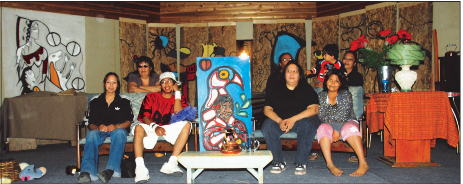
Seated front and centre, Morriseau's family got to enjoy an original play about their father's artistic development and personal life while he lived in the Red Lake area. Written and performed by De-ba-jeh-mu-jig Theatre Group from Manitoulin Island, the play brought together over 200 Morriseau supporters, collectors, artists, family and friends.