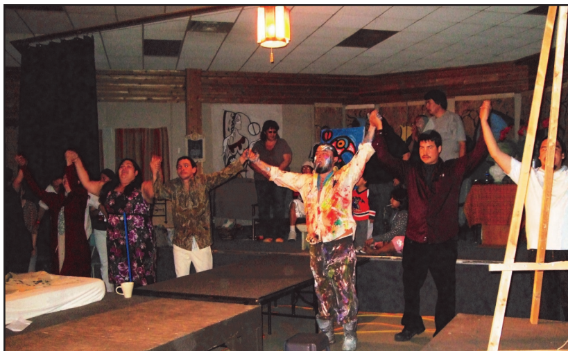
Taking a final bow after performing an original play called Norval-A Born Artist .

"The members of De-ba-jeh-mu-jig Theatre Group were magnificent. The play cleverly worked in a blank and symbolic canvas that during the play was worked on by an artist/actor to become a stylized portrait of Norval with his signature Thunderbird on his head. This painting was presented to Norval's children at the conclusion of the performance. The play and the entire weekend very poignantly reconnected the Morriseau family rightfully back to their father and his legacy in a way they have not been."