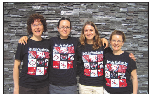
A t-shirt contest was organized to promote the festival. Contestants were asked to draw their personal interpretation of Woodland Art. Nine lucky winners were selected from over fifty entries! Heritage staff show off the finished product!

"..I must tell you how amazing the event was for the people that were so lucky to experience this very special event. It was inspiring to see people from the ROM, Community Arts Ontario, Toronto galleries, arts and heritage enthusiasts, artists and the First Nation community turn out to Red Lake to share the important story of Norval and the Woodland artists. It has affected me very deeply and I will contemplate the experience for a long time to come."