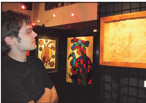
A visitor admires an early work done by Norval Morrisseau on birch bark at the opening of the Festival.

The festival was a tremendous success. Many people, including Morrisseau's children, told us they felt privileged to be taking part in this historic event. The following are excerpts from e-mails and blog entries we received following the festival. The photos highlight some of the most memorable moments of the weekend.