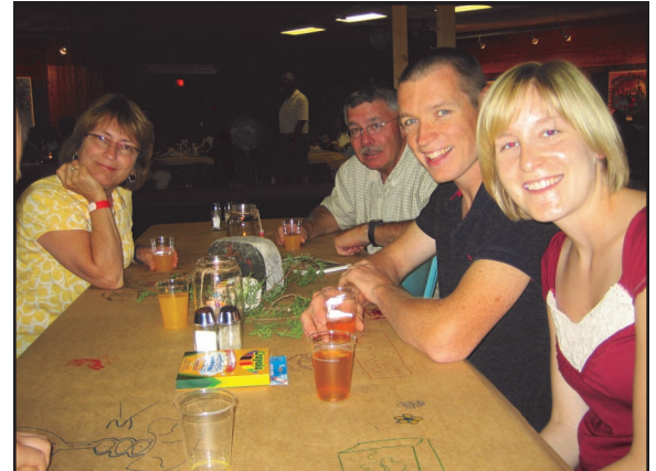
Visitors take in the delicious meal and wait for the play to begin!